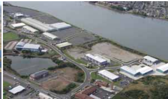
FURNESS BUSINESS PARK

Furness Enterprise in association with The Northwest Regional Development Agency & West Lakes Renaissance